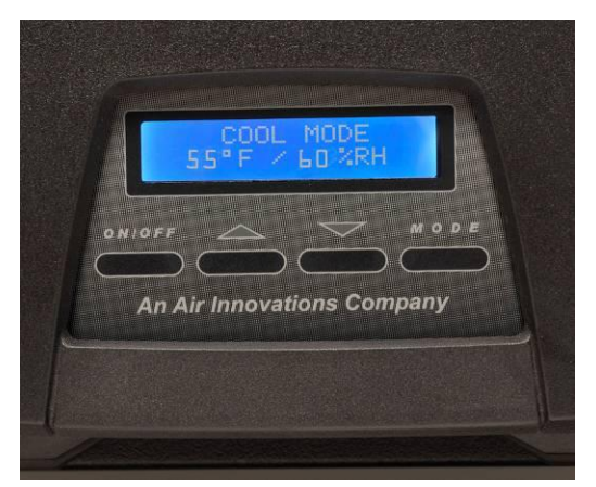
Local Interface Controller