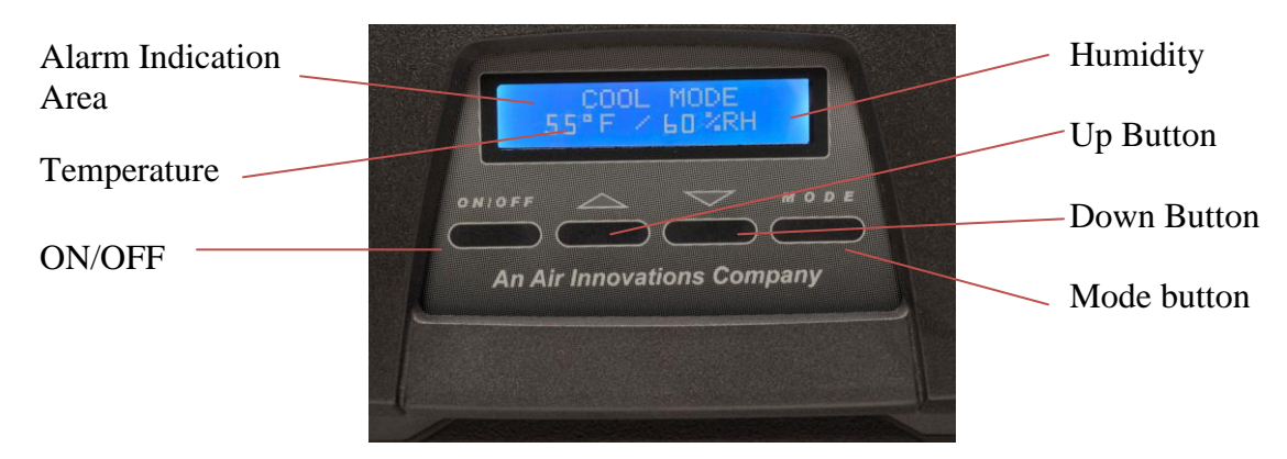
Settings – Press and hold the "Mode" button for five (5) seconds to access the following settings.