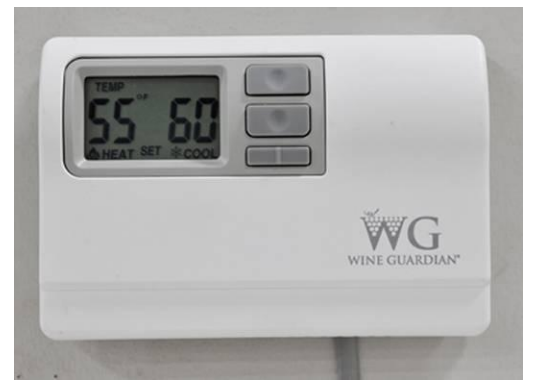
Optional Remote Interface Controller

The Wine Guardian Local Interface Controller is a combination temperature and humidity controller with single stage cooling, heating and humidifier control. Each Wine Guardian Through-the-Wall unit is supplied with a Local Interface Controller as an integral component of its assembly. It is installed at the factory and tested prior to shipment.