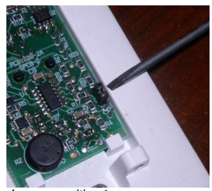
Jumper position 1